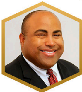
MAYOR DAN RIVERA LAWRENCE