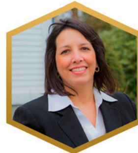
MAYOR KIM DRISCOLL SALEM