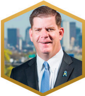
MAYOR MARTIN J. WALSH BOSTON