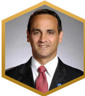
MAYOR JOSEPH CURTATONE SOMERVILLE