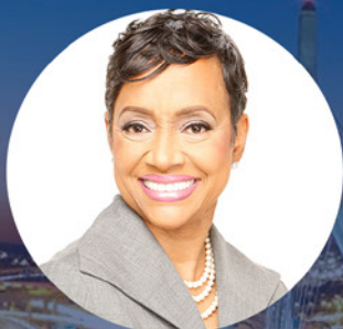
JUDGE GLENDA HATCHETT

FOUNDING PARTNER OF THE HATCHETT FIRM, P.C. STAR OF THE VERDICT WITH JUDGE HATCHETT KEYNOTE SPEAKER