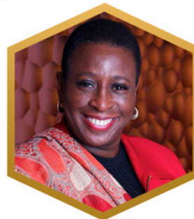
MAYOR YVONNE SPICER FRAMINGHAM

LOCATION: ROXBURY COMMUNITY COLLEGE Media Arts Building • 1234 Columbus Ave Roxbury Crossing, MA 02120