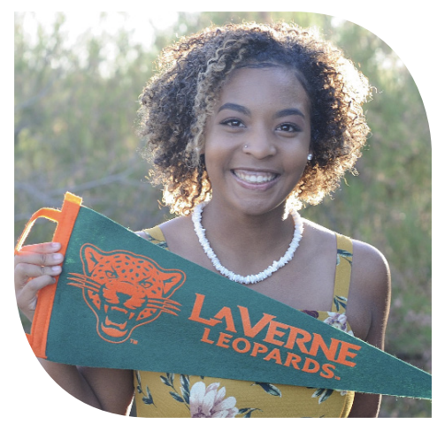
Academy Of Careers and Exploration Destination: La Verne University, CA