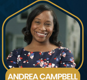
District 4 Boston City Councilor